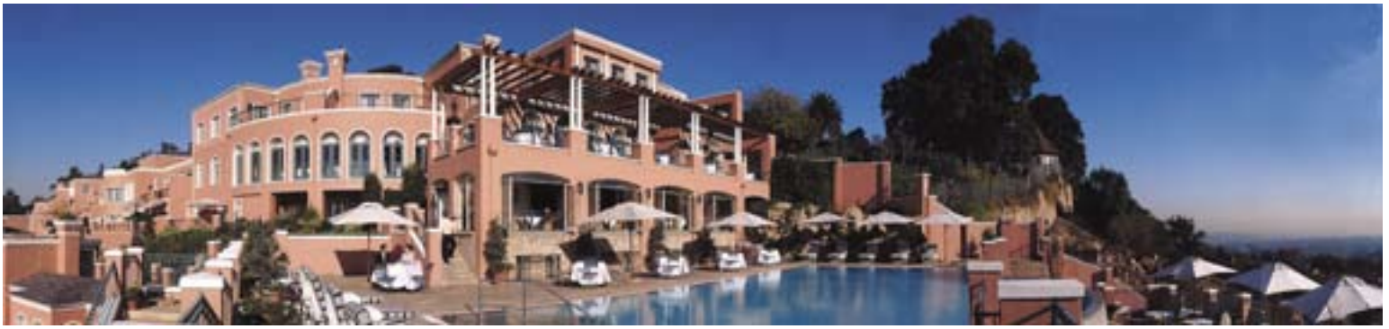
The Westcliff Hotel