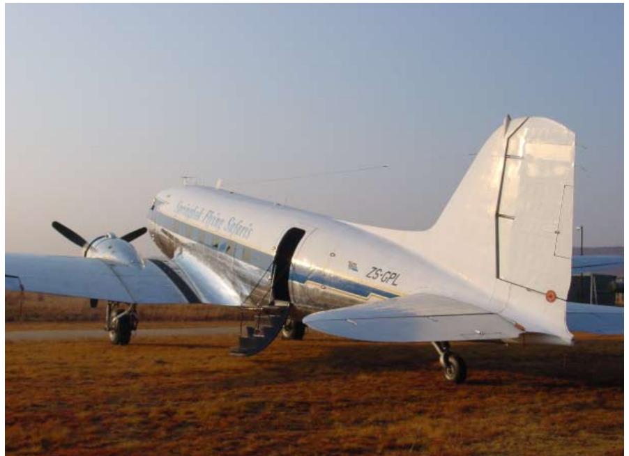
Ready for work at Johannesburg

Long distances are traveled in comfort as you skim gracefully over rivers and mountains, over native villages and herds of animals in the ambiance of the golden age of aviation. With all-inclusive cabin service, generous leg-room and space to walk about, you can visit the cockpit, socialize, or view the scenery passing below – the best way to truly understand Africa's size, topography and diversity.