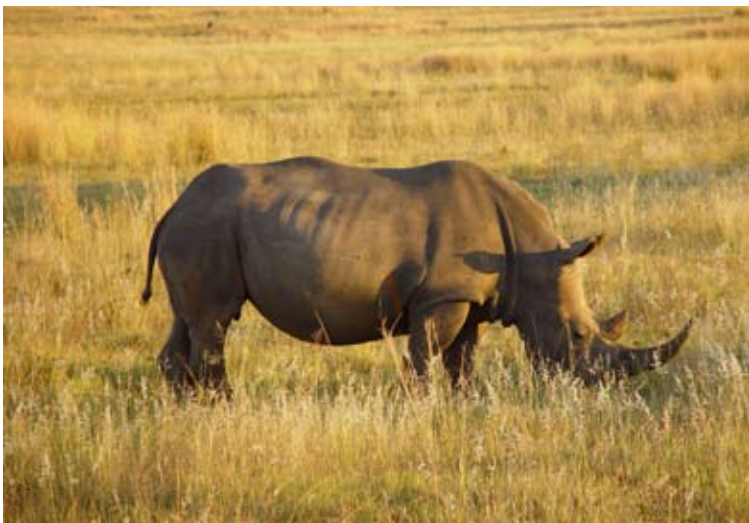
Wildlife at Phinda Private Game Reserve