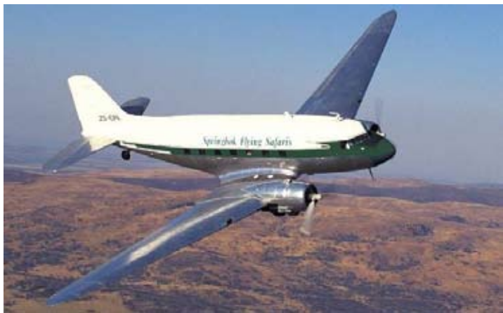
Flying over Suikerbosrand