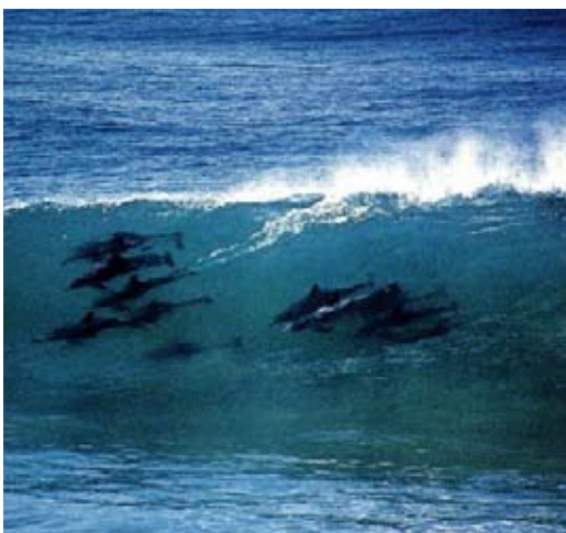
Dolphins riding the wave