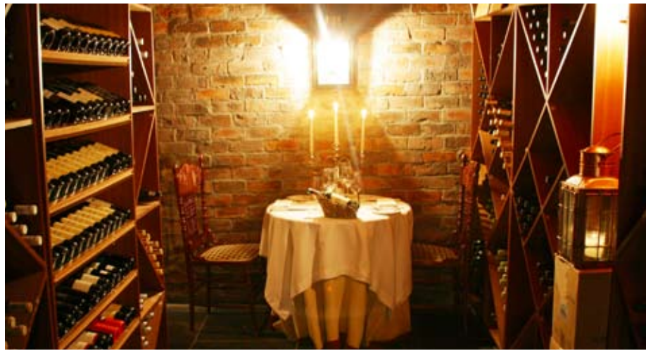
The Cellars-Hohenort Hotel

During our visit to the Cape, we will have a luxury coach at our disposal throughout each day and evening, until we return to the hotel after supper. Lunch will be at selected restaurants in the region. Supper