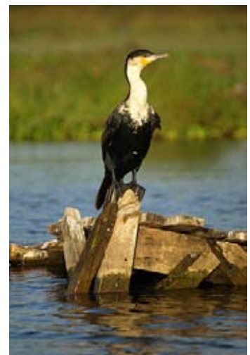
White breasted cormorants