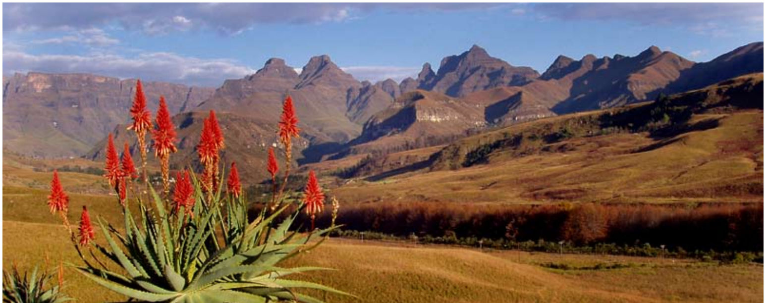
The beautiful Drakensberg mountains

We will first visit Heatherton Towers, the main reception building, situated 40 minutes from the Lodge. It is, in fact, a Frontier War-era fortified homestead, complete with dramatic gun turrets and private chapel. From Heatherton Towers we will drive to the Fish River Lodge and