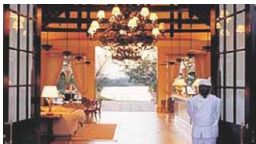
Victoria Falls Hotel