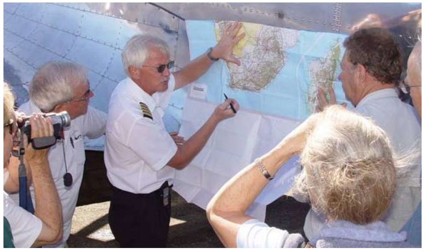
A little briefing time prior to departure

We have reserved luxury ocean-view rooms. All are air-conditioned and offer a truly idyllic and indulgent experience. The hotel has two swimming pools, one of which is heated, and both visually flow into the ocean below. Other hotel facilities include an award-winning wine cellar stocked with a selection of the best local wines, and a Collection McGrath boutique – offering a unique selection of specialty items and clothing from the area. Supper will be at The Plettenberg, with guests from the town of Plettenberg Bay.