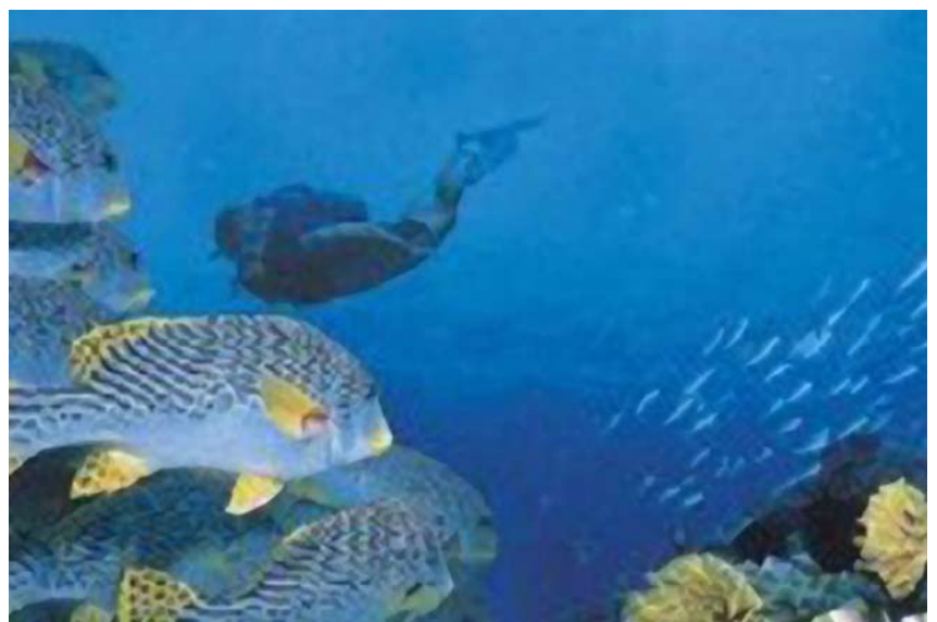
Diving at Indigo Bay

Phinda Private Game Reserve is situated in the lush Maputaland region in northern KwaZulu-Natal, South Africa. Bordering the iSimangaliso/Greater St. Lucia Wetland Park – another World Heritage Site – Phinda comprises 55,000 acres of prime conservation land. Seven distinct habitats shelter an abundance of wildlife including Africa's Big Five (lion, leopard, elephant, black and white rhino, buffalo) and over 380 bird species.