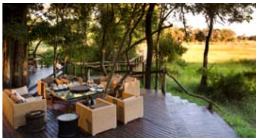
Nxabega Tented Camp