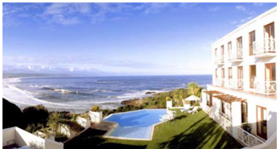
The Plettenberg Hotel