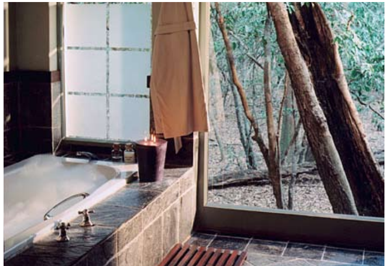
Phinda Forest Lodge