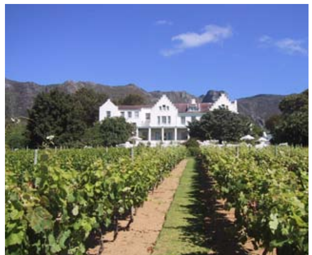
The Cellars-Hohenort Hotel