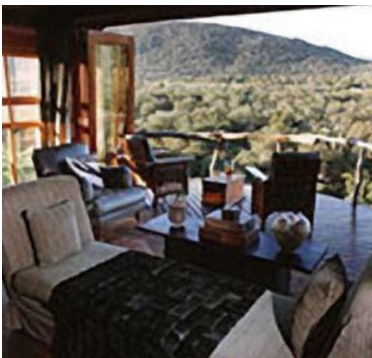
Fish River Lodge