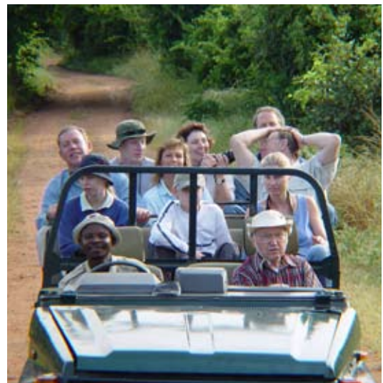
4x4 safari vehicles to see and photograph wildlife