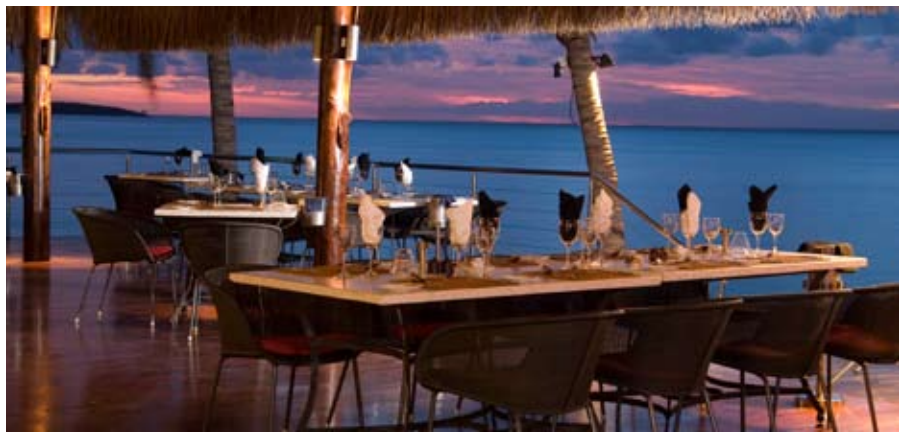
Indigo Bay Resort