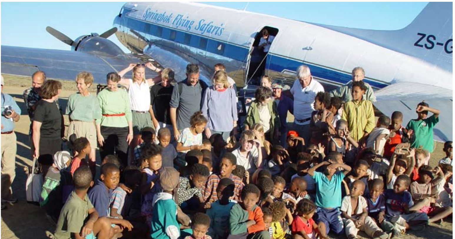
Farewell group photo

Private custom flying safari expeditions can also be planned for 4 to 18 guests. This option is ideal for small groups of family or friends, and it enables you to choose the places, itineraries and departure dates that are most interesting to you. Please contact a Travcoa journey planner at 800.992.2005.